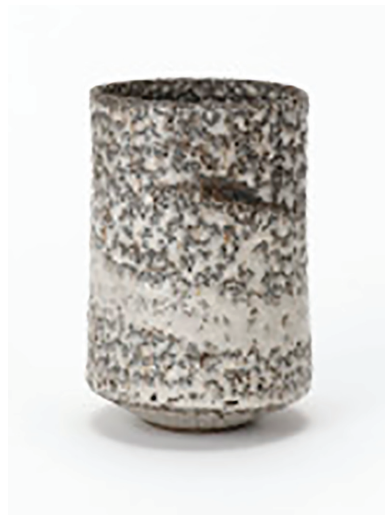
Cylindrical Pot (P100) 16 cm Lucie Rie 1960 Cylindrical pot, made of oxidised stoneware, with a pitted white glaze over dark body. Thrown oxidised stoneware with pitted white glaze over dark body. Fired to 1,250°C. Craft Council Collection.

She studied pottery under Michael Powolny at the Vienna Kunstgewerbeschule, a school of arts and crafts associated with the Wiener Werkstätte, in which she enrolled in 1922.