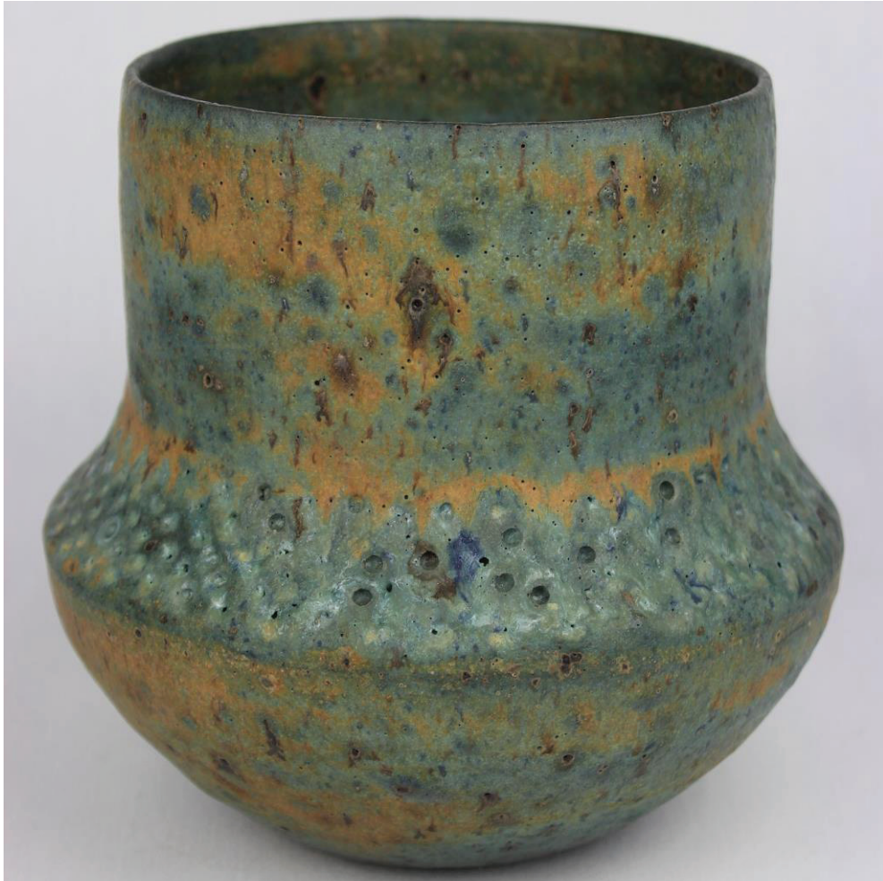
Thrown Vase by Lucie Rie, DBE . British Austrian potter(1902 – 1995).

A PUBLICATION OF THE BRITISH PAIN SOCIETY