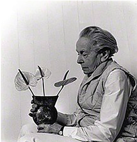
Lucie Rie DBE 1902–1995

Lucie Rie was an Austrian-born British studio potter, known for her exquisite wheel-thrown vessels and her innovative approach to glazing and firing techniques. She is considered one of the most important ceramic artists of the 20th century.