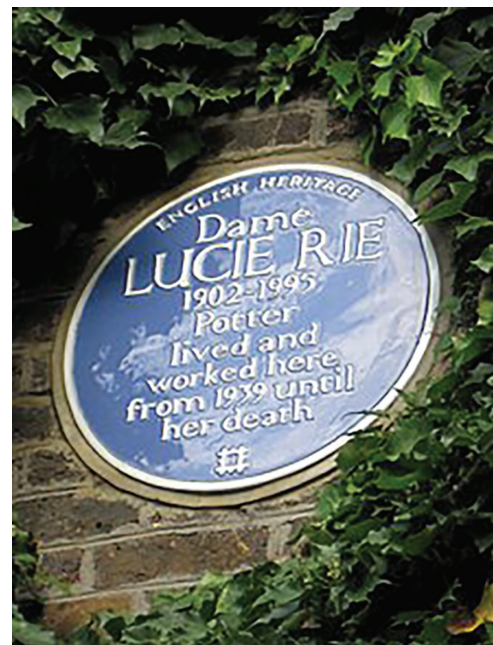
Blue plaque at her former home on 18 Albion Mews, Paddington, London.

She is best remembered for her bowl and bottle forms. Her pottery is displayed in collections around the world, including the Museum of Modern Art in New York, the York Art Gallery in the United Kingdom, the Carnegie Museum of Art in Pittsburgh and Paisley Museum in Scotland. She influenced many during her 60-year career and developed very inventive kiln processing. Her studio was moved and reconstructed in the new ceramics gallery at the Victoria and Albert Museum opened in 2009. She was awarded the title of Dame Commander (DCE). i