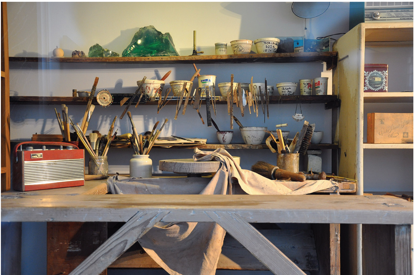
Lucie Rie's workshop, as exhibited in the Victoria and Albert Museum, London.