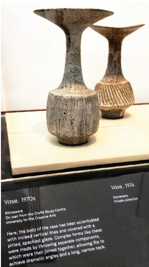
Vases by Lucie Rie on display at Kettle's Yard, Cambridge April 2023.

She stopped making pottery in 1990, when she suffered the first of a series of strokes. She died at home in London on 1 April 1995, aged 93 years.