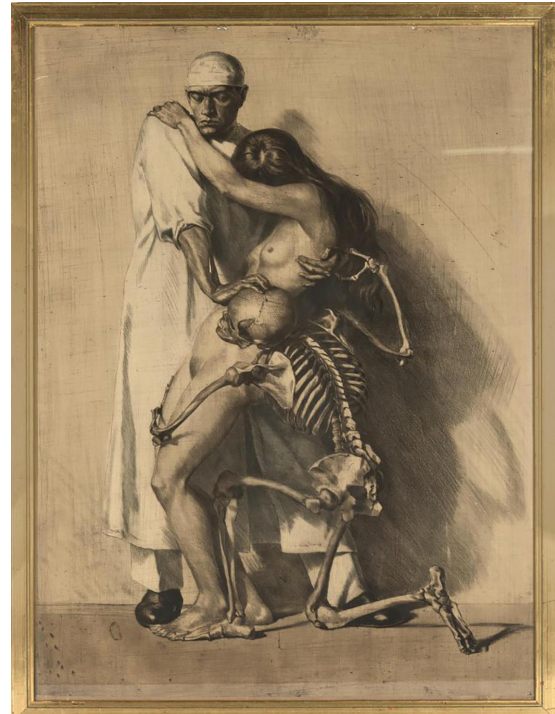
Ivo Saliger (1894–1987), 'Der Arzt ringt mit der Todt'. The physician struggles with death. Credit Teddy Bader Which Treatment is Best? CRC Press 2023.

For example, Hippocrates recognised that some diseases, such as acute infections, were likely to resolve on their own, while others, such as chronic conditions, might have a more unpredictable course. His belief that environmental and lifestyle factors could influence the course of a disease meant that a